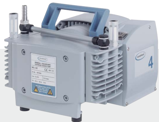
ME 4 NT 4.0 m 3 /h 70 mbar