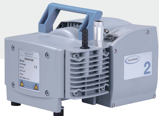
ME 2 NT 2.0 m 3 /h 70 mbar