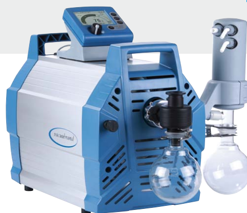
PC 3016 NT VARIO 19.3 m 3 /h 70 mbar