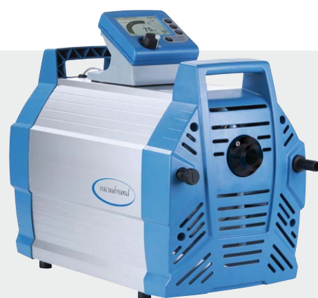
ME 16C NT VARIO 19.3 m 3 /h 70 mbar